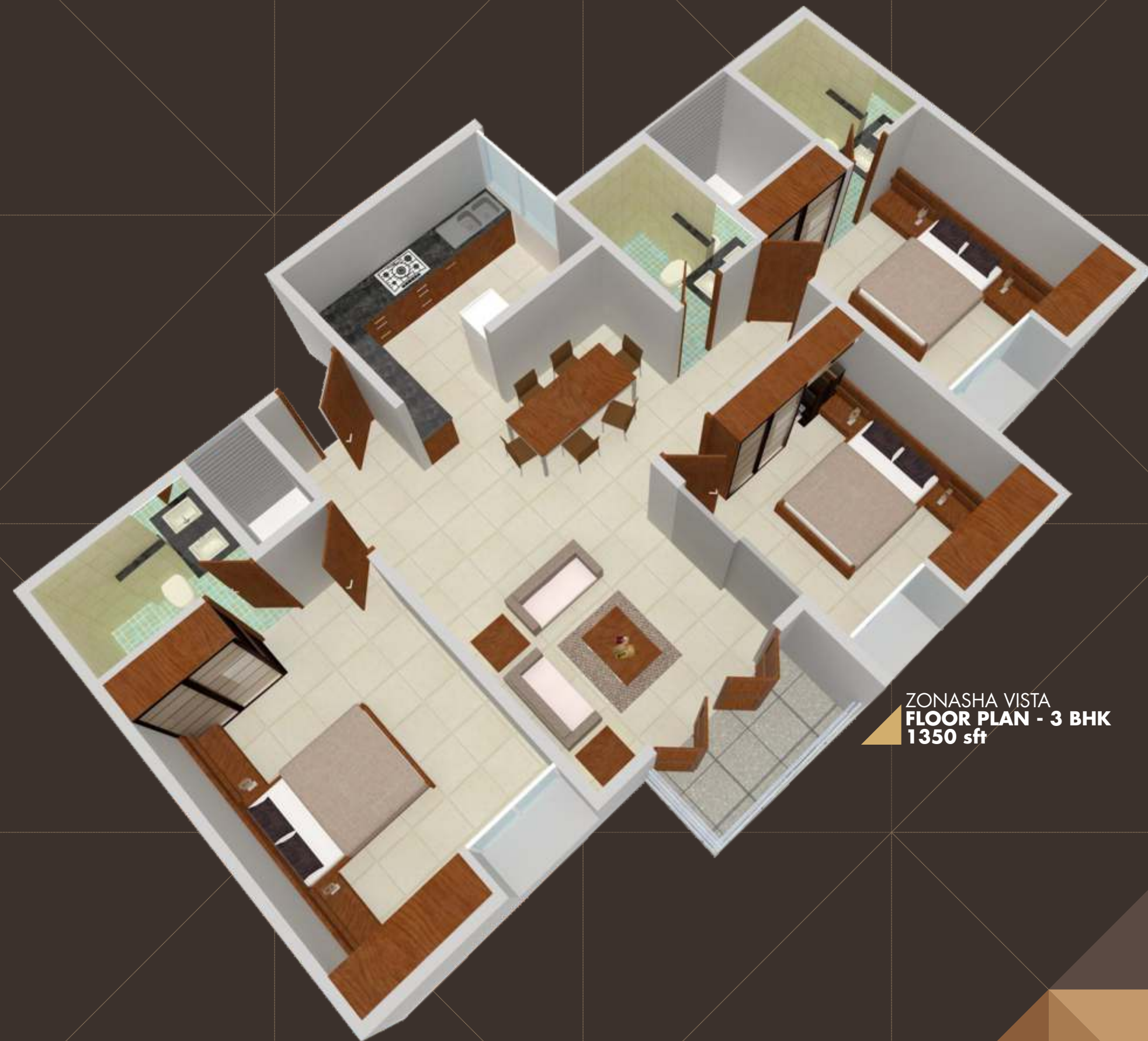
ZONASHA VISTA FLOOR PLAN - 3 BHK 1350 sft