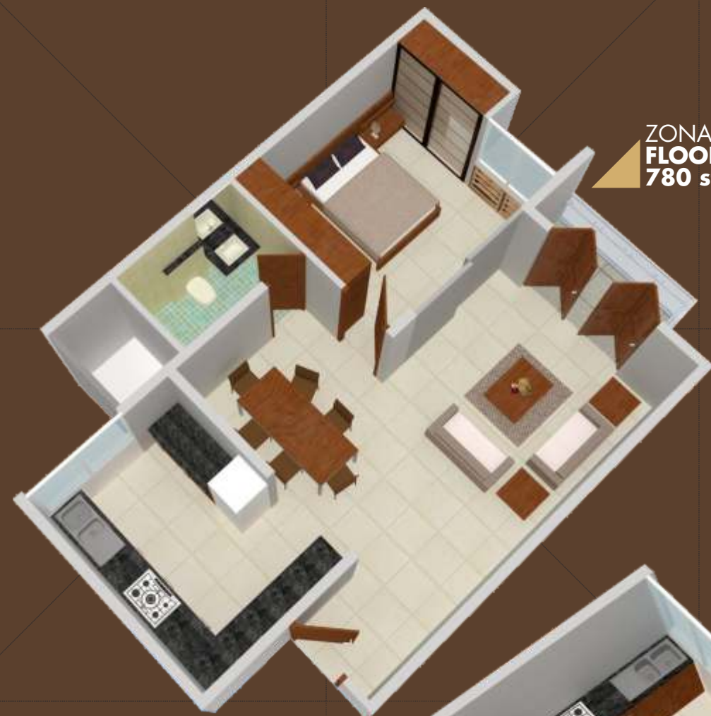
ZONASHA VISTA FLOOR PLAN - 1 BHK 780 sft