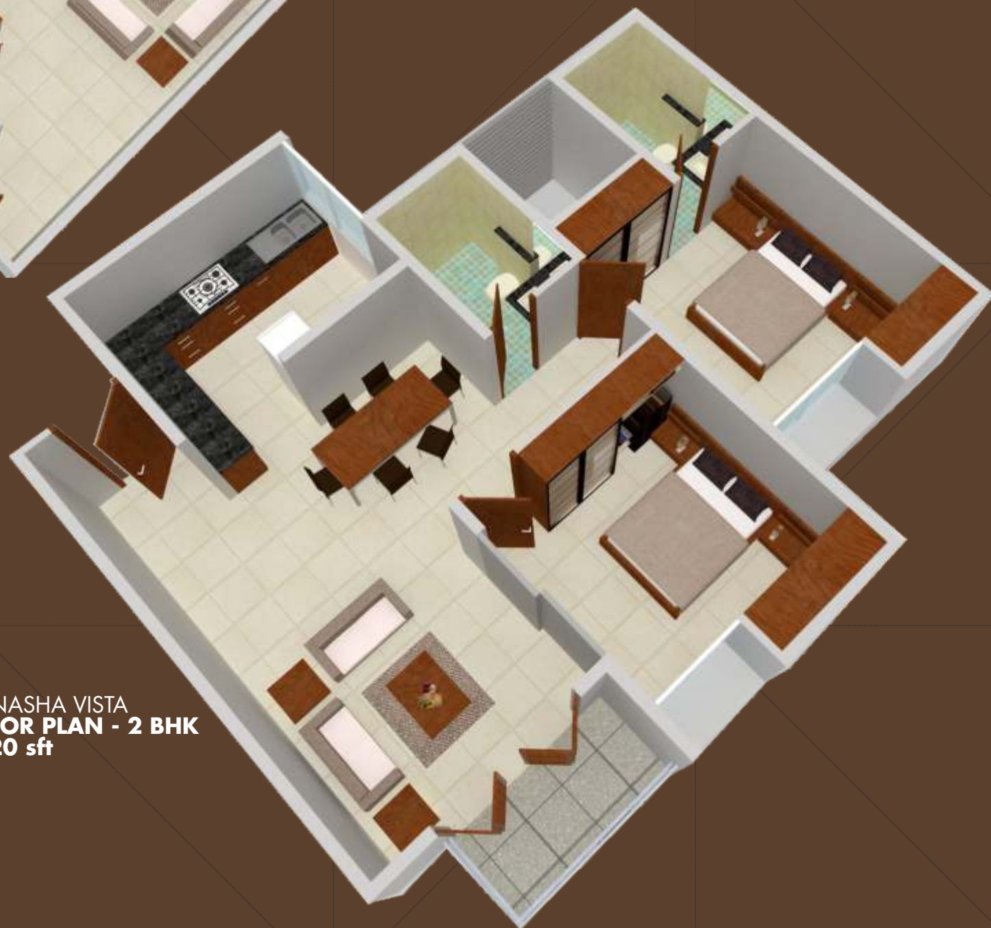
ZONASHA VISTA FLOOR PLAN - 2 BHK 1020 sft